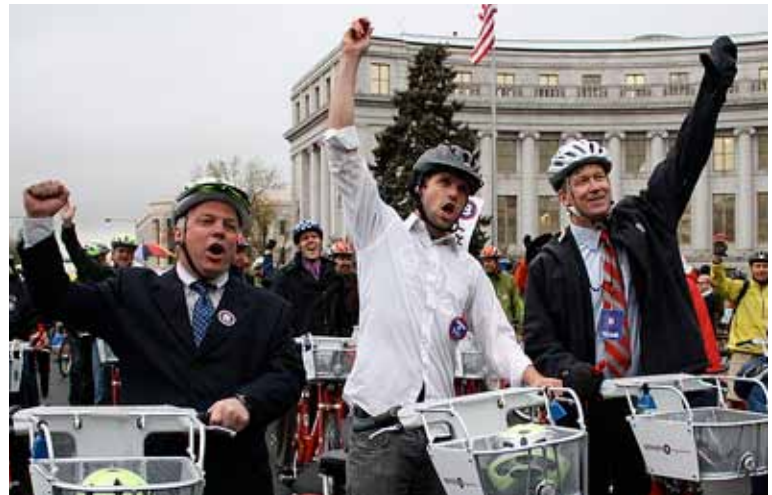
Now Governor-elect John Hickenlooper at the Launch of Denver's B-cycle bike share program.

on our website) is an effort to gather signatures from residents of Denver and visitors to our City who believe that the new Mayor should adopt Mayor Hickenlooper's visionary goal of 10% mode-share by bicycle by 2018. Second, we encourage you to become a card carrying member