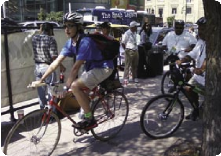
We led delegations on rides, offered directions and went out for ice cream.