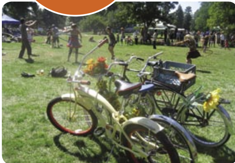
A gaggle of cruisers cheers on some happy hula-hoopers.