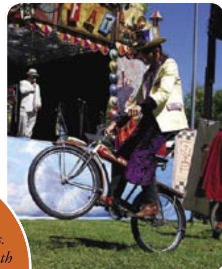
One of the mellower tricks performed by Tour entertainers.

There are no words that can describe how fantastic Tour de Fat was. It surpassed last year in both ridership and how sore my face was from smiling all day.