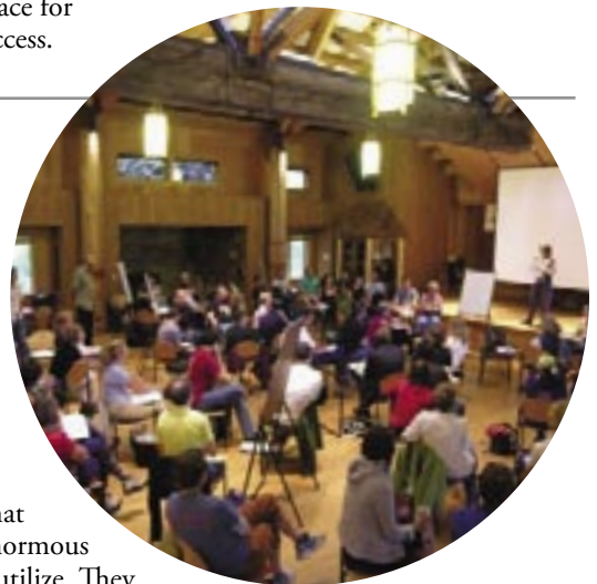
Thunderheaders furthering a Complete Streets agenda

The Thunderhead Alliance for Biking and Walking is the national coalition of state and local bicycle and pedestrian advocacy organizations working together to promote bicycling and walking in North American communities.