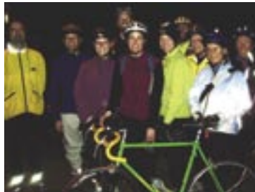
The gang on BikeDenver's first tour of the lights from City Park