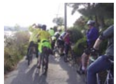
We found time for some hilly, invigorating rides around the island.