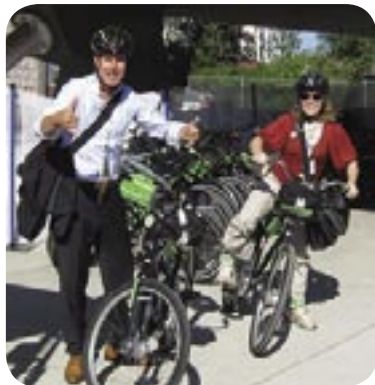
Conventioners embraced it.