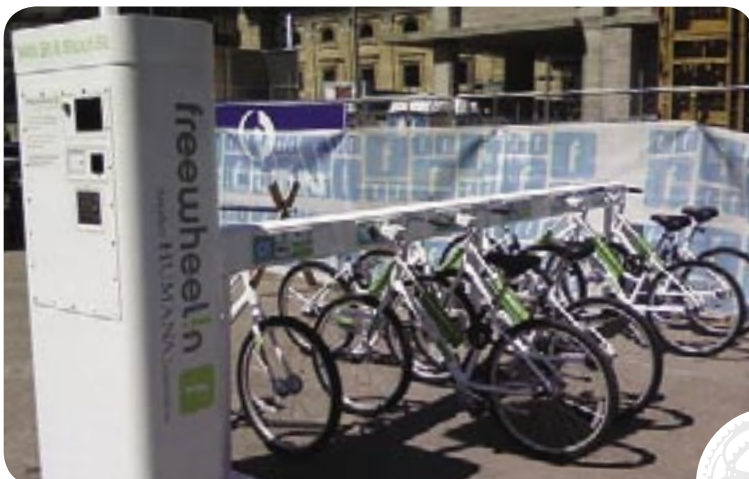
...and now—for starters—Denver gets one of these!

This August, BikeDenver volunteers spent hundreds of man hours helping to operate Freewheel!n, a bike share system operated during the DNC convention. I was one of those volunteers, and can say without hesitation, it was one of the best times I've ever had doing so much work.