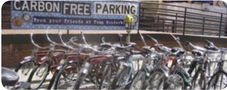
A taste of things to come...