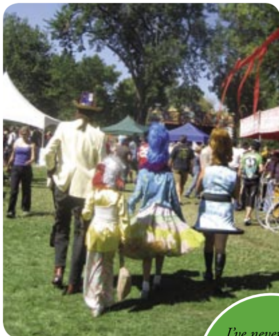
Big hats, big hair, big skirts...big fashion-spotting could be had throughout the day.